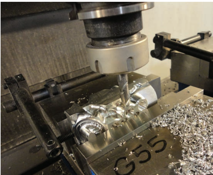
One in a row of five magnesium Y blocks mounted on the Kalitta Motorsports Haas VF-4 CNC, shown here between operations.